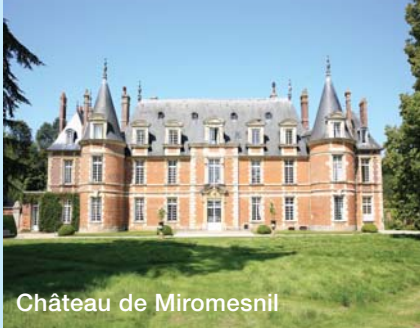
Château de Miromesnil